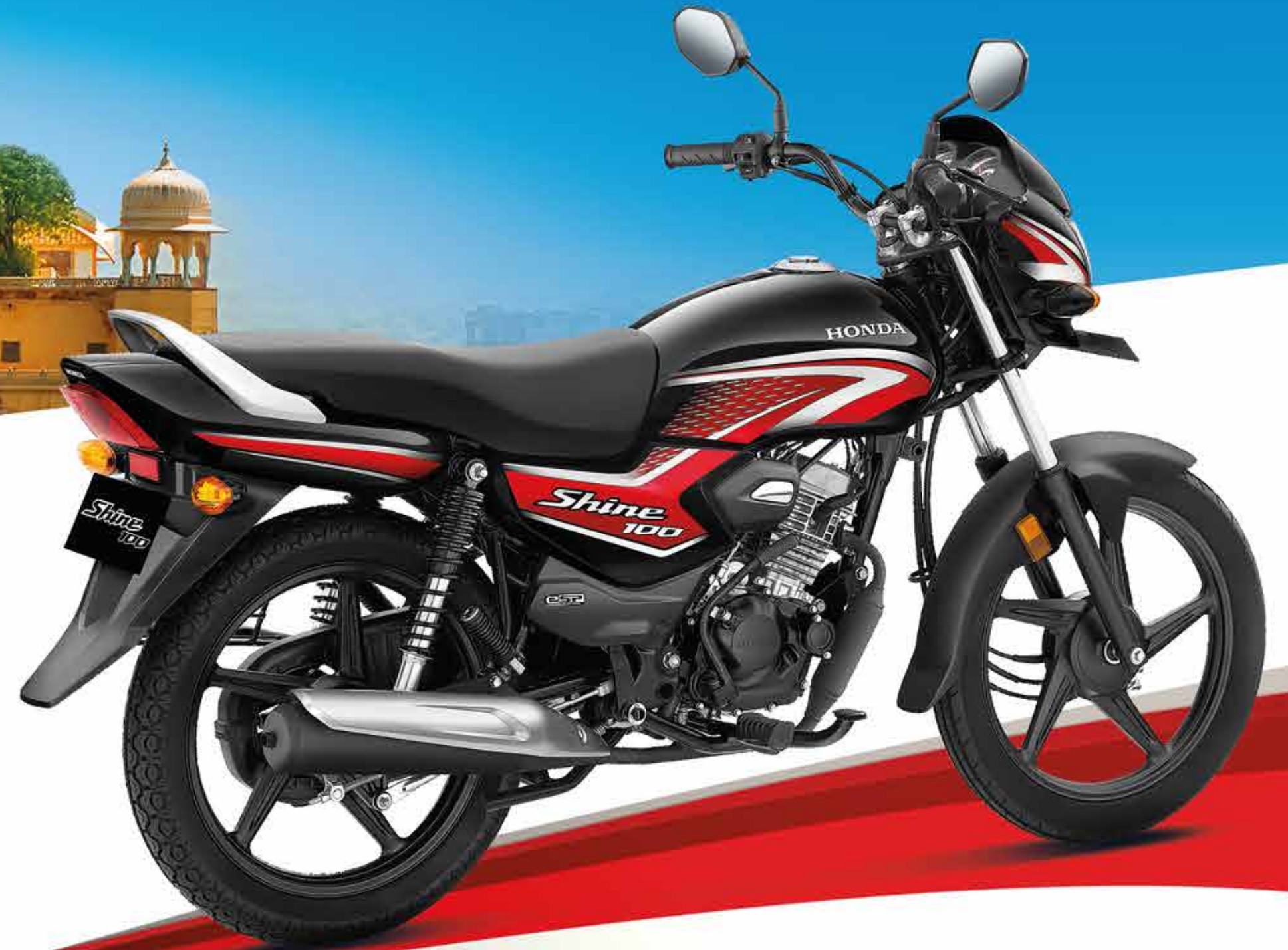
The symbol of never-ending trust, quality, and reliability.